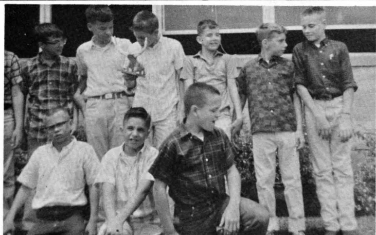
A Sixth Grade Class

You should always go out with the first boy who asks you if you have accepted his invitation. It's very rude to break a date with one boy to go out with another, and won't help your reputation with other boys. What if you went with your boyfriend and saw the other boy? How would you feel if you were in his place? Why don't you talk to your boyfriend about it. I'm sure he will understand if he has any respect for you.