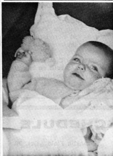
Look, Mom, no teeth!