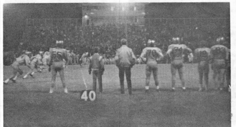
Matadors at work!